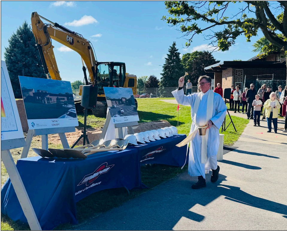
The St. Mary Catholic Church project received a blessing Sept. 7 during a groundbreaking ceremony.