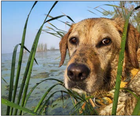
Lu, The Wonder Dog, enjoys days going on outings such as going on duck hunts.

What's cool as a mentor, or a dad, is it also allows you to pay more attention to the little things. The spider struggling through a dew-soaked web, a distant, Great Blue Heron silently hunting in the cattails and just how good the dog is at hearing the incoming birds before they are visible – every nuance of her actions. When you don't have to worry about shouldering your own firearm, it opens up