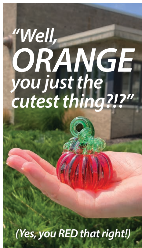
(Yes, you RED that right!)