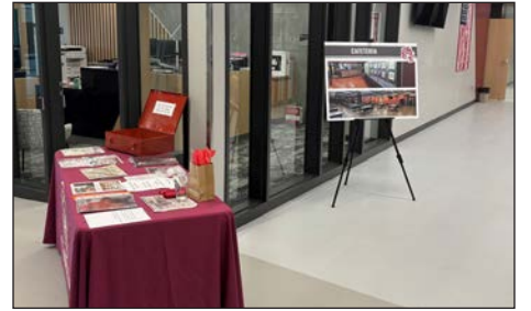
A table with a time capsule showing items from 1975 and new ones that will be added was displayed near the front entrance of the school.