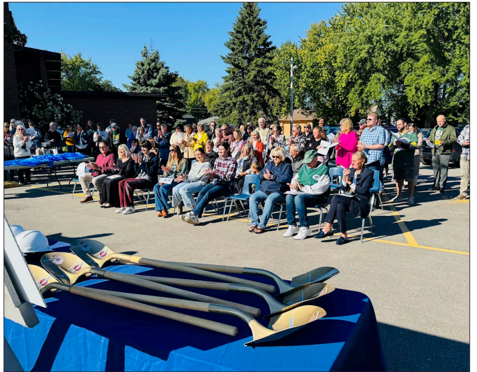
Members of the church gathered for the Sept. 7 groundbreaking ceremony at St. Mary Catholic Church.