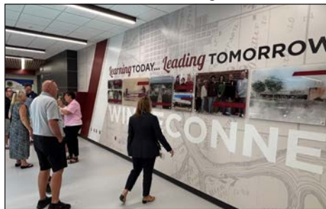
Community members were able to see inside the renovated middle school building for the first time during the dedication celebration event.

The 1975 time capsule was displayed in the front entrance along with the new