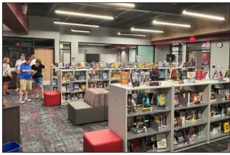
Those attending the ceremonies toured the building afterward, seeing renovated areas such as the library and media center.