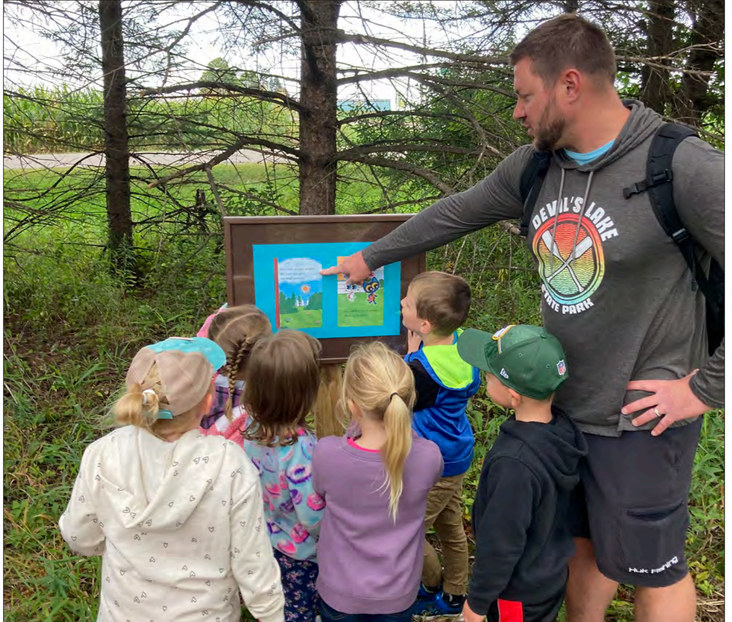
The Norbert Rich School Forest has received grant support in previous years.

Successful applicants will be recognized Nov. 12 at a community event, Celebrate Education in Winneconne.