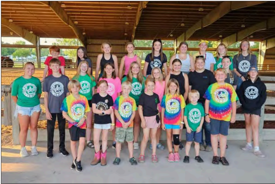
White Cedars 4-H members.

For anyone interested in joining 4-H, White Cedars has its first meeting of the next 4-H year at 6:30 p.m. Sept. 8 at the Butte des Morts Lions Club Clubhouse in Butte des Morts.