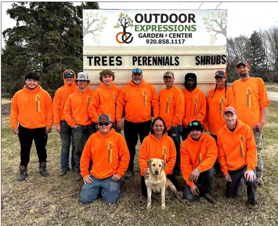
The crew of Outdoor Expressions, ready to serve the greater Winneconne area.

As for Outdoor Expressions, Marten assures the community, “We’re here! Our crews are ready to serve, and we’ll