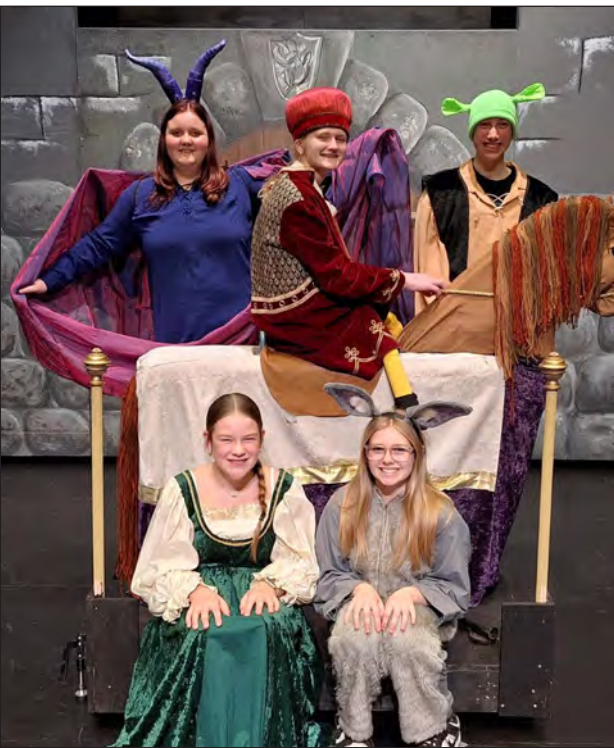
A collection of cast members for Shrek Jr. cannot wait to entertain audiences next weekend.

“Once upon a time, in a faraway swamp, there lived an ogre named Shrek. One day, Shrek finds his swamp invaded by banished fairytale misfits who have been cast off by Lord Farquaad, a tiny terror with big ambitions,” explains the playbill. “When Shrek sets off with a wisecracking donkey to confront Farquaad, he’s handed a task — if he rescues feisty princess