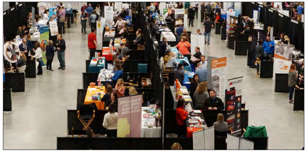
An image of a previous, very busy Fox Cities Employment Fair.

The Fox Valley Workforce Development Board is an equal opportunity employer and service provider. If you have a disability and need assistance with this information, please dial 7-1-1 for Wisconsin Relay Service or at 800-947-3529. At no cost, you may request information in an alternate format, including language assistance or translation information to your preferred language by contacting us at (920) 594-3655