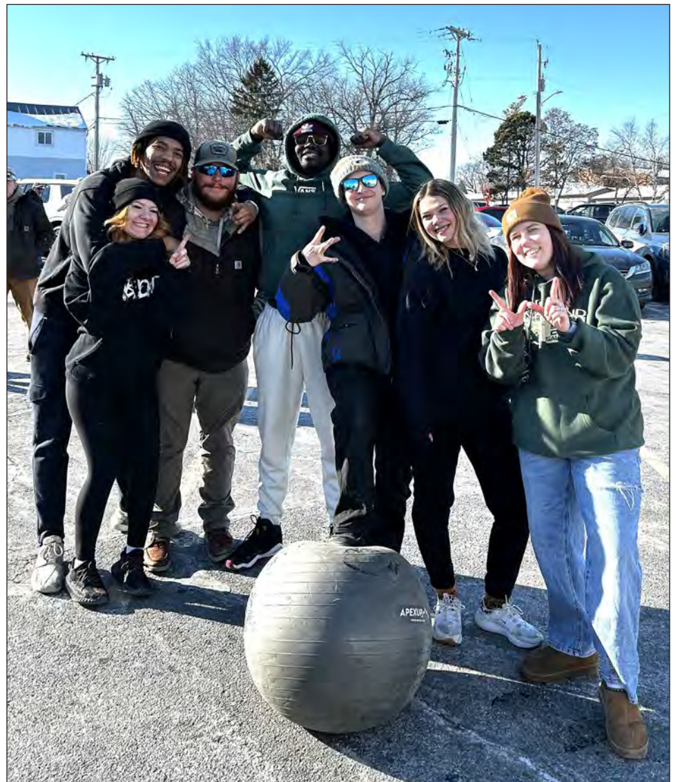
The winning kickball team at this year's Winter Finderland was 'Not the Lucers'