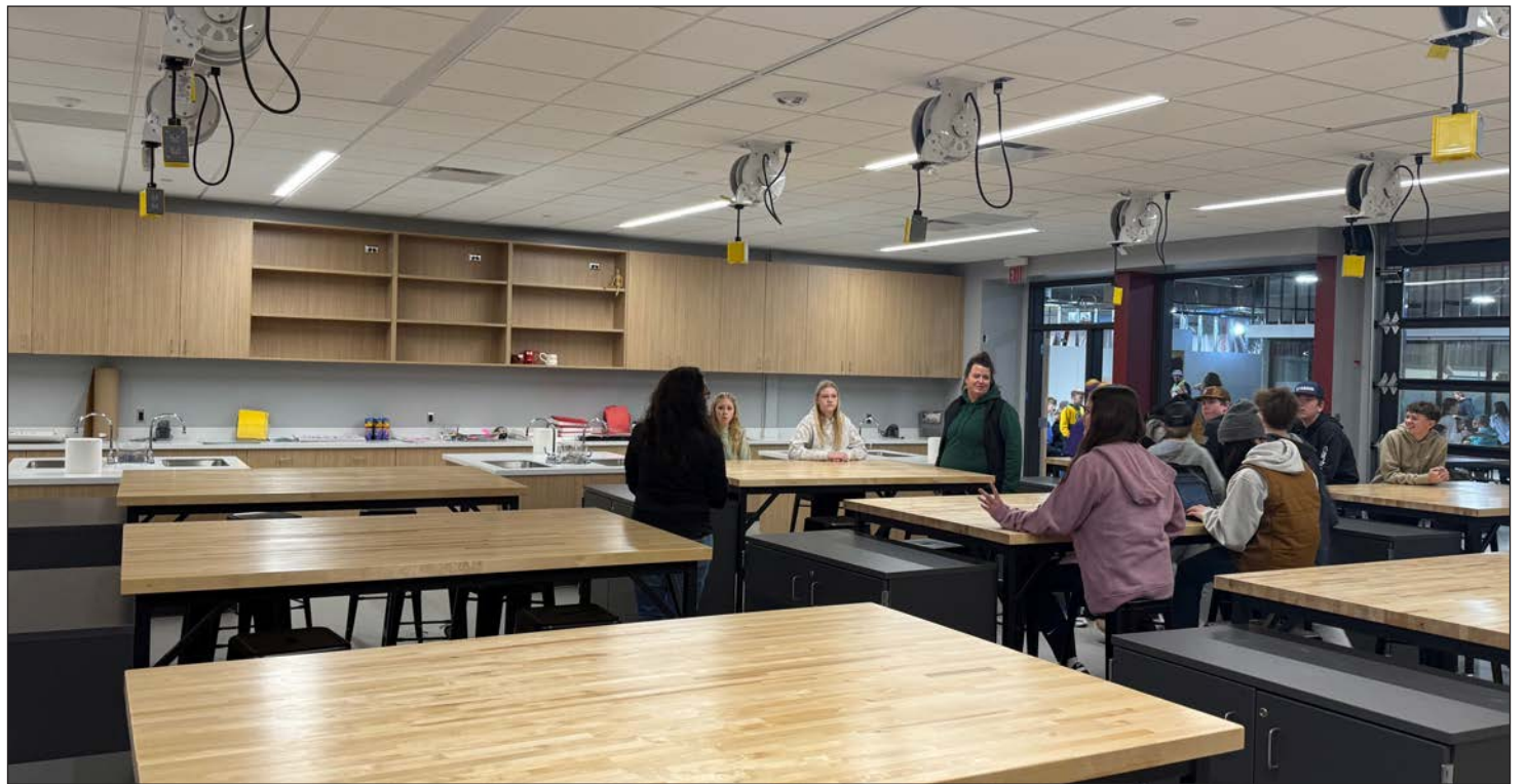
A view of the new middle school art room open for business.