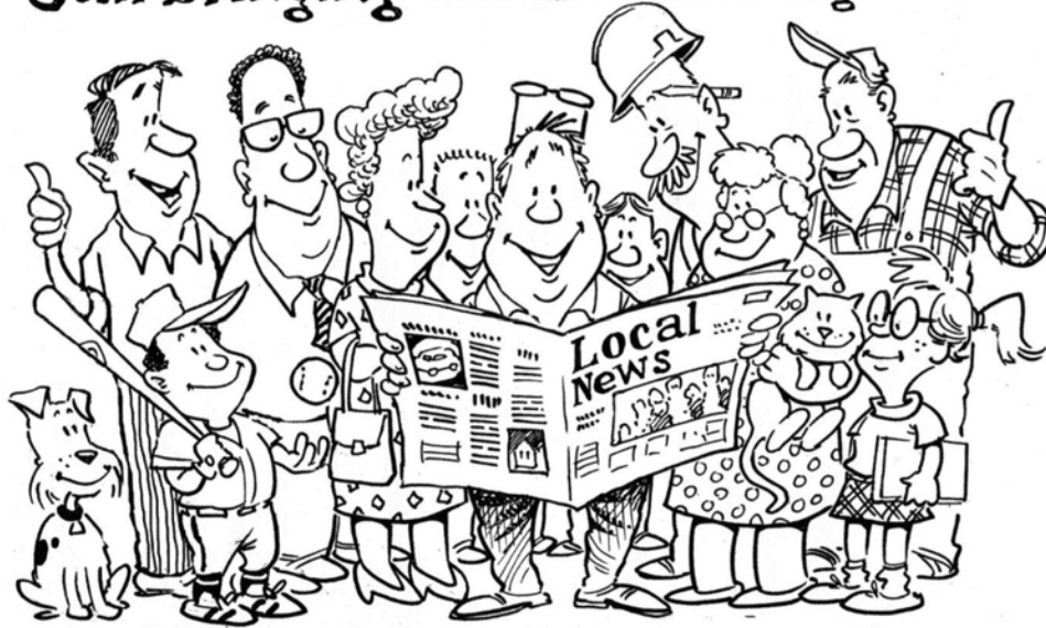
DAVE GRANLUND © www.davegranlund.com