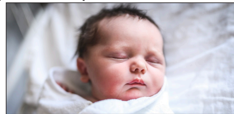
Harper and Olivia (tie)

New names in ThedaCare's most popular baby name list for 2024 include Theo/Theodore, Hudson and Jack. For girls, new names on the list this year include Charlotte, Violet, Hazel and Harper.