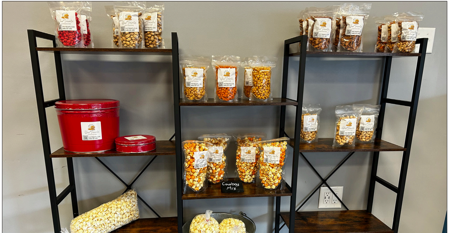
A view of just some of the varied products offered at Your Favorite Concessions.

ready begun producing their product at the once diner, with plans to open its doors to customers in the near future.